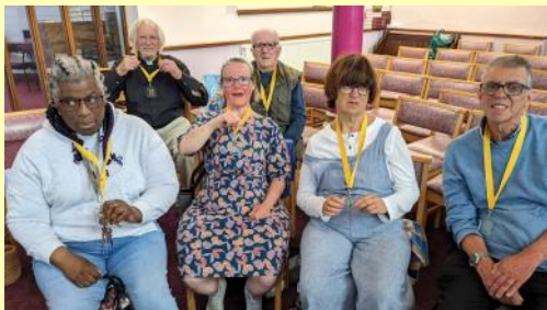
Everyone enjoyed the Olympic-themed service