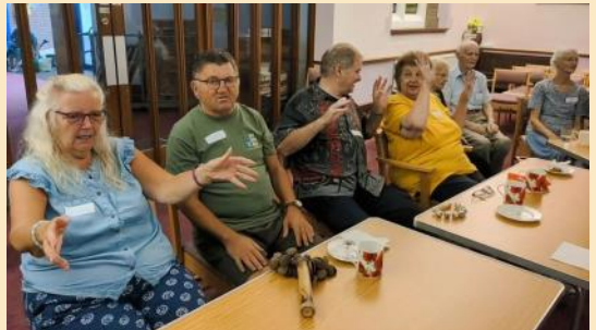
Sound It Out: Enjoying 50s & 60s songs