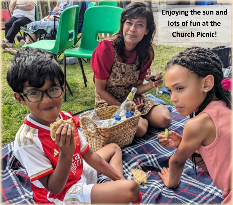
Enjoying the sun and lots of fun at the Church Picnic!