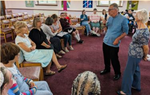
What was the theme at Causeway?