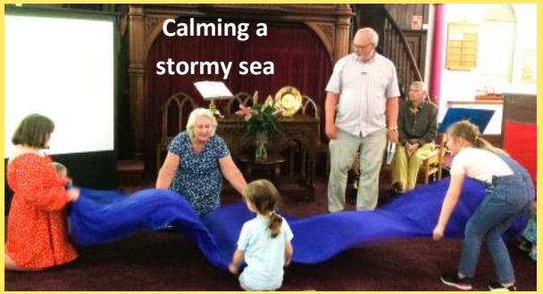
Calming a stormy sea