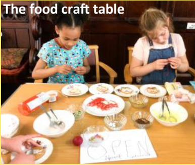
The food craft table