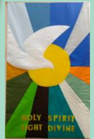
Some of the lovely hand-made banners