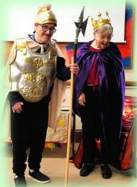
Taking part in the role play