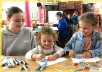
Painting our fish suncatchers