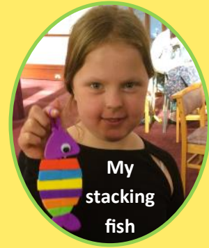
My stacking fish