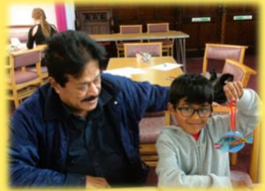
My fish suncatcher