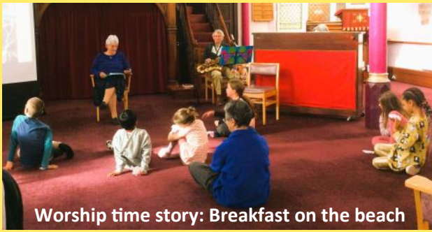
Worship time story: Breakfast on the beach