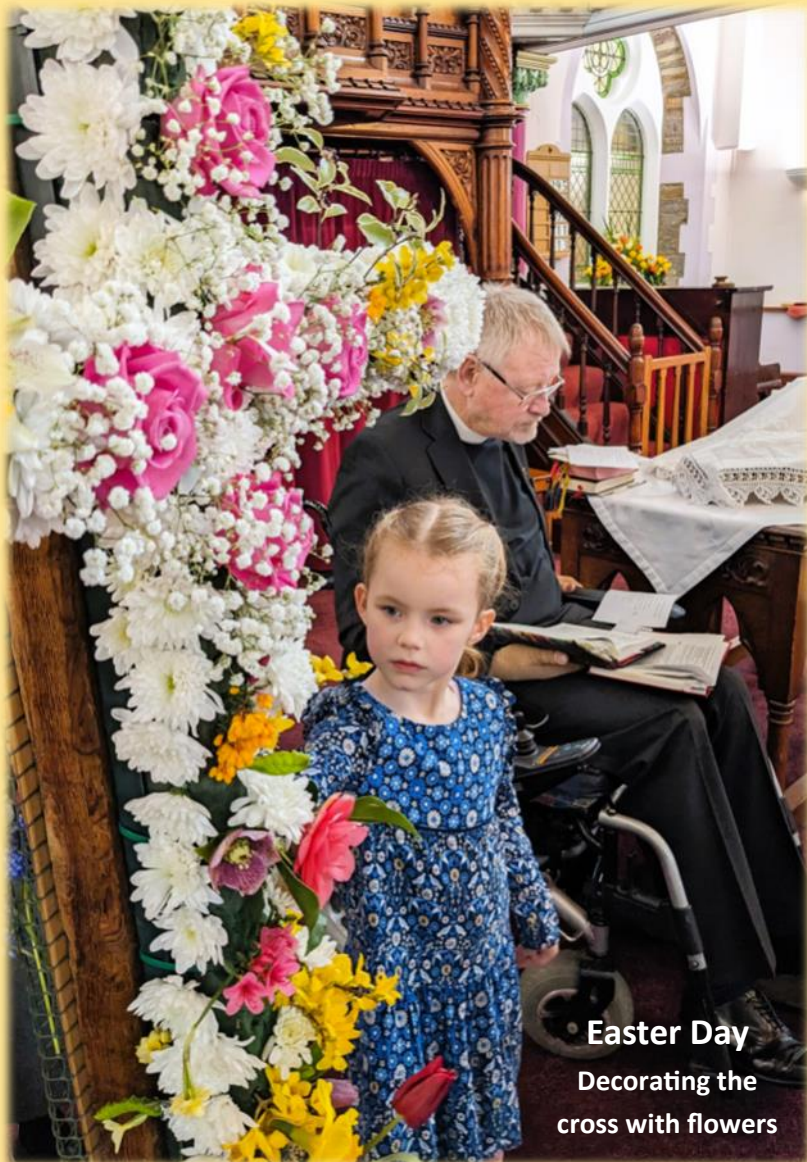
Easter Day Decorating the cross with flowers