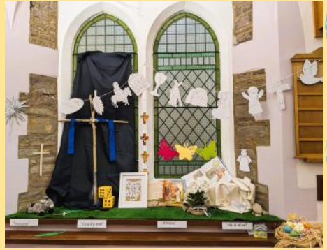
One of the beautifully decorated windows