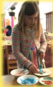
Icing fish biscuits