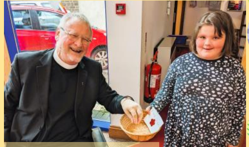
Sunday Club: Distributing Easter eggs