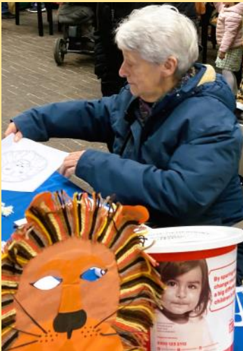
Helping out on the day