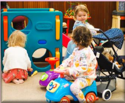
Happy children, parents, grandparents and helpers having fun