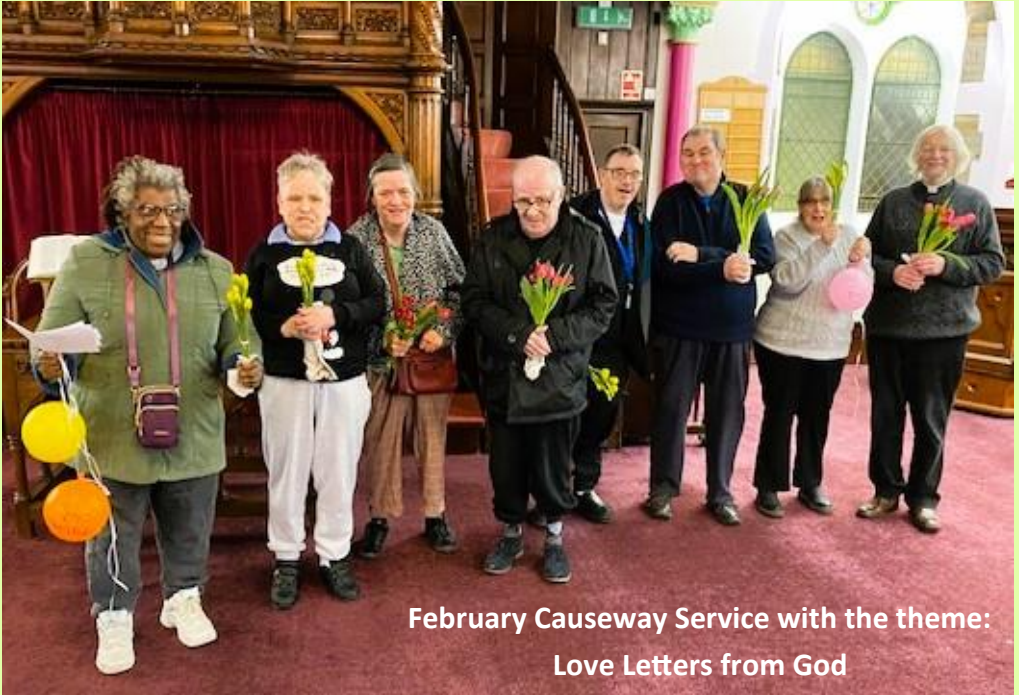
February Causeway Service with the theme: Love Letters from God