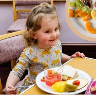
Food craft: Pancake pictures