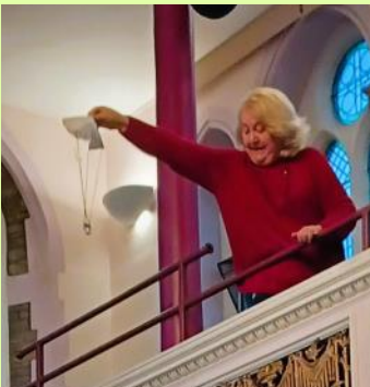
Fun parachuting down from above at Café Church