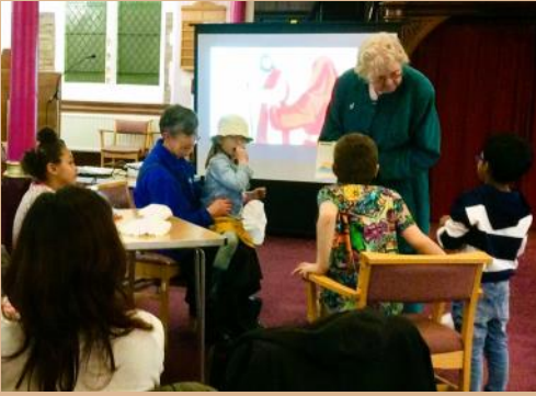
Reading the bible story about temptation