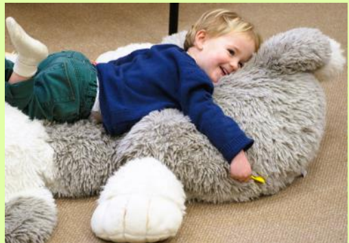
Enjoying cuddles at Parents and Toddlers Group