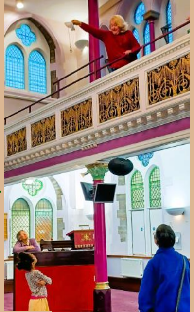
Parachute: A safe way of travelling down from a great height