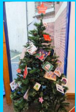
Christmas Card Tree