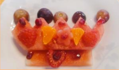
Creating the Wise Men's crowns with fruit and cardboard!