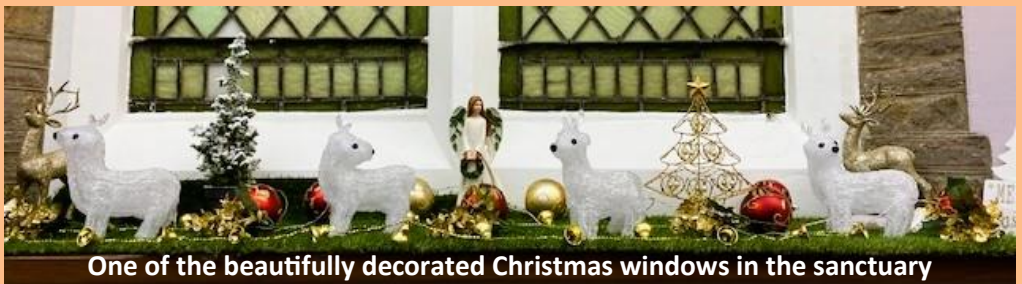
One of the beautifully decorated Christmas windows in the sanctuary