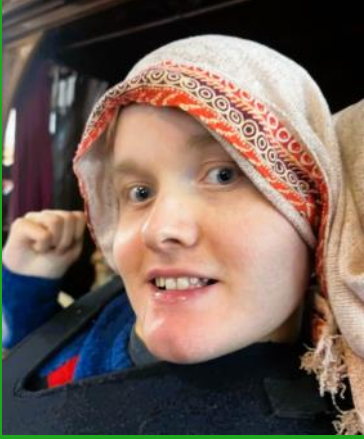
Our dramatised Bible reading of the Nativity story