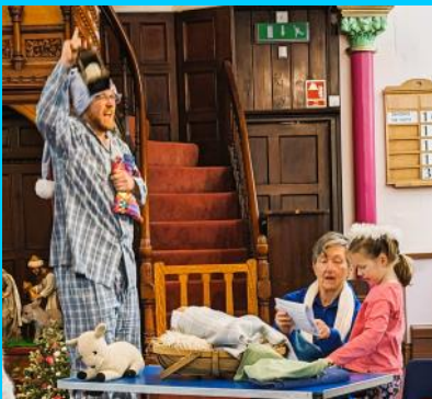
Christmas Nativity Service