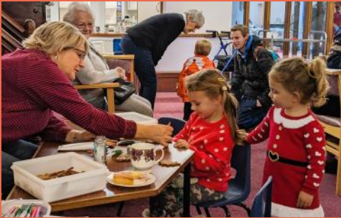
Decorating gingerbread figures