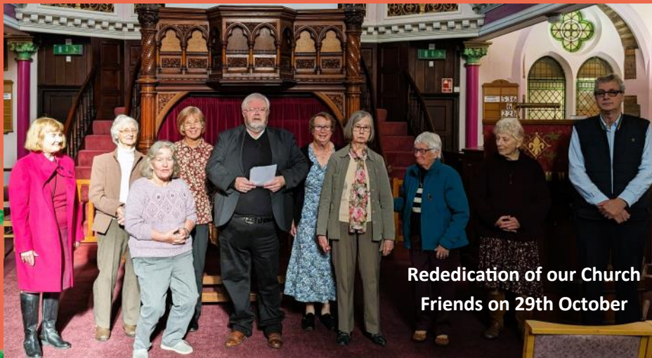
Rededication of our Church Friends on 29th October