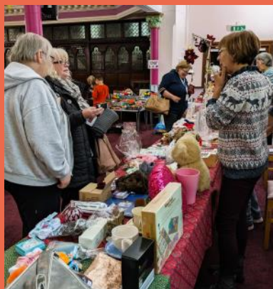
Fun at the Winter Fair