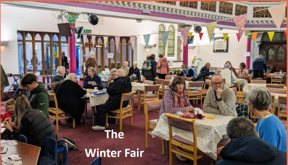
The Winter Fair