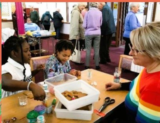
Icing gingerbread figures at Half Term Hobnob