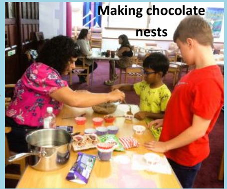
Making chocolate nests

http://christ-church-barnstaple.org.uk/pbhwyaakn/cafe-church/