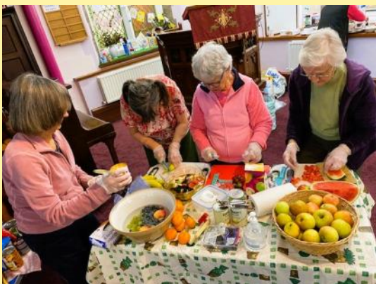
Making fresh fruit salad