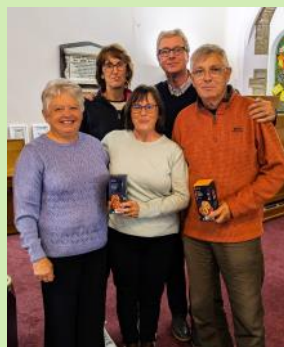
Winning Team: 5 Candles