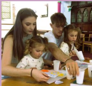
Café Church: Crafting fun