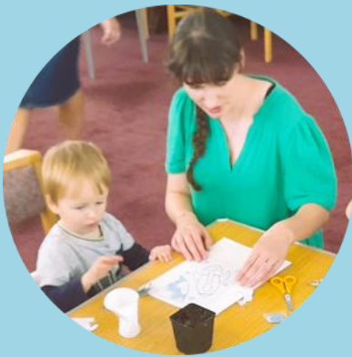
Making and showing our sand pictures