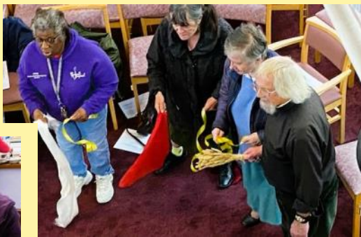
Singing: "We plough the fields & scatter"