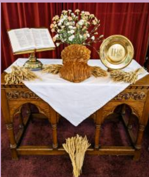
Harvest at Christ Church