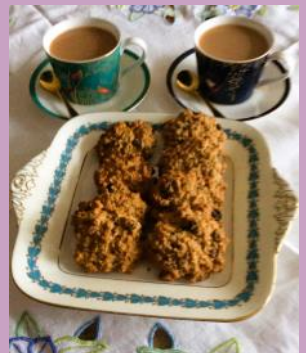
Recipe: Harvest Cookies