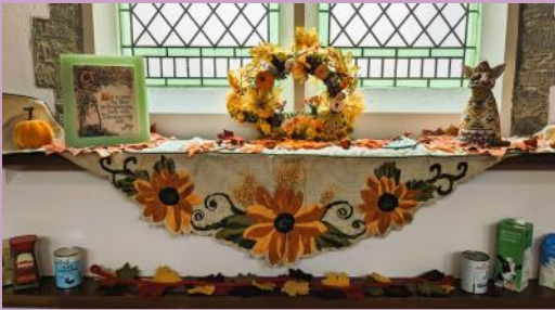
The church was beautifully decorated