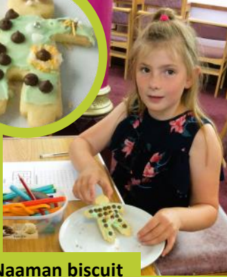
My Naaman biscuit