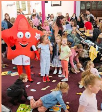
Great fun at The Giant Wiggle