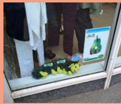
Hunt the Caterpillars