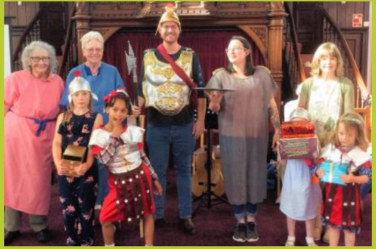
The cast of the Naaman story