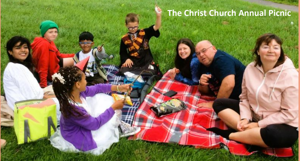
The Christ Church Annual Picnic