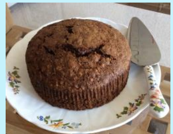
Carrot Cake Recipe