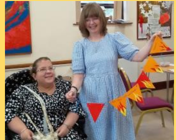
Pentecost flame flags