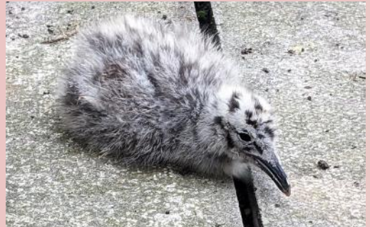
A seagull chick is being raised by it's parents in Noah's Park