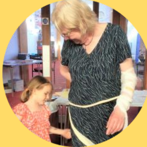
Very good at bandaging!