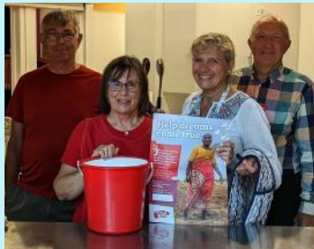
The Big Brekkie Team