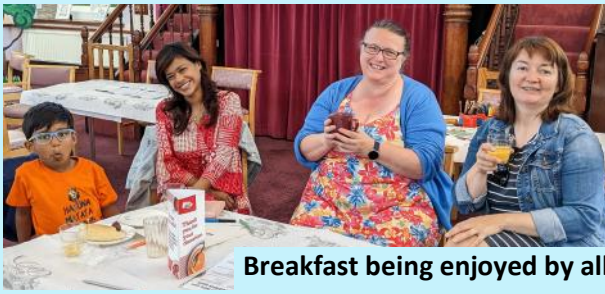
Breakfast being enjoyed by all