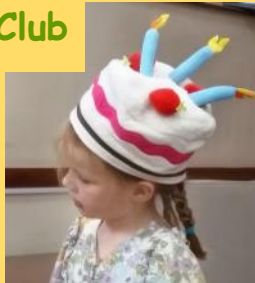
The Pentecost hat