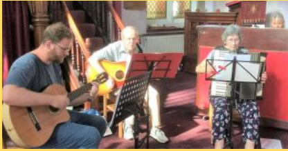
The Café Church Band