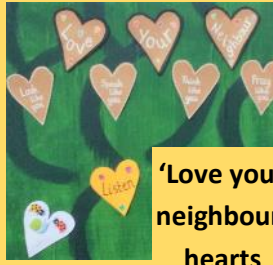
'Love your neighbour' hearts