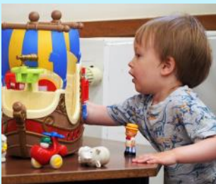
Fun at Parents & Toddlers