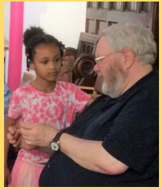
Deep in conversation