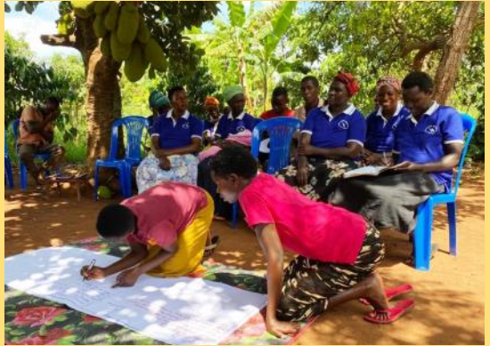
Tree planting planning meeting