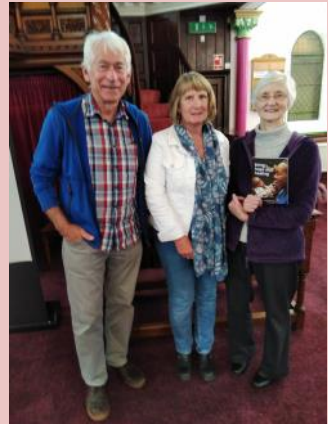
The friends enjoyed a 'Mercy Ships' talk