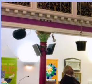
What went on at Café Church?