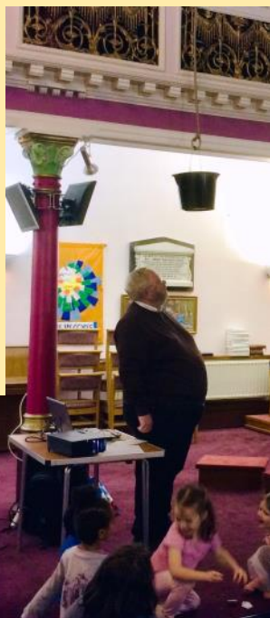
The 'Well Bucket' descending from the balcony