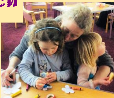
Decorating my prayer flower