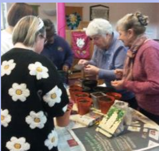
Causeway Service: Planting seeds