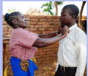
Christian Aid Week