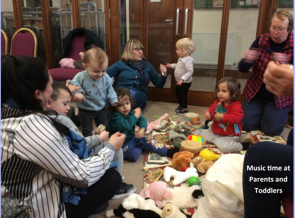
Music time at Parents and Toddlers