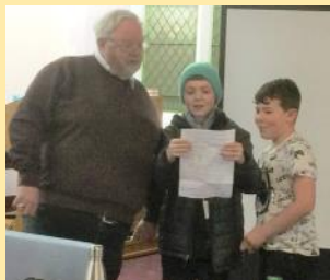
Reading the water prayer