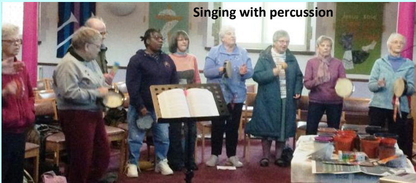
Singing with percussion