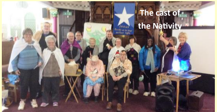
The cast of the Nativity