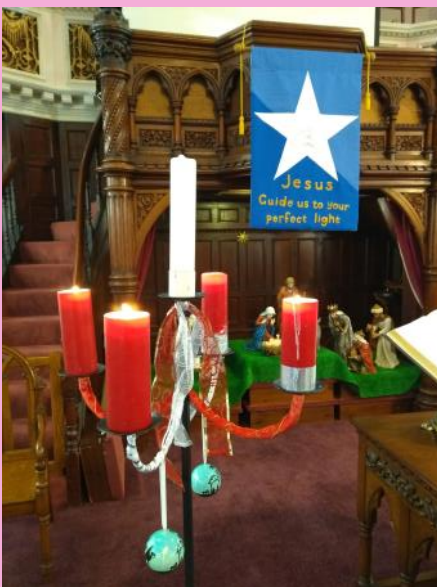
Advent candles and Nativity scene