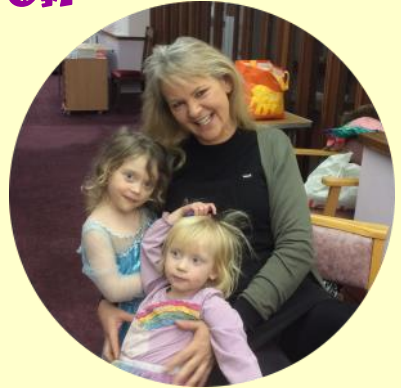
“The children were full of energy and enthusiasm”