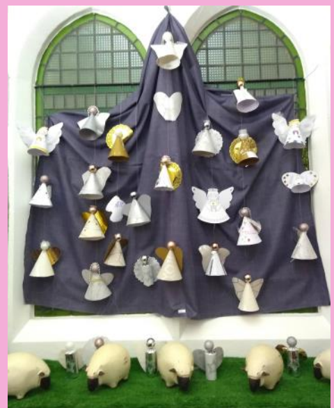
The Angels window