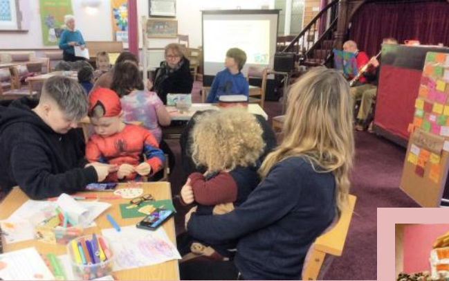
Eff giving the story talk