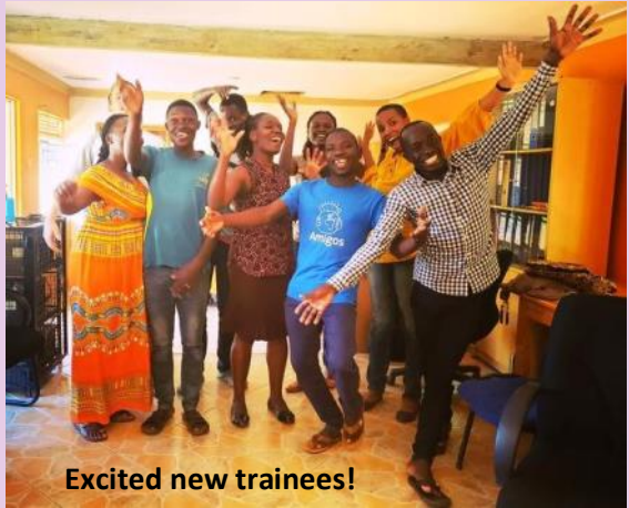
Excited new trainees!