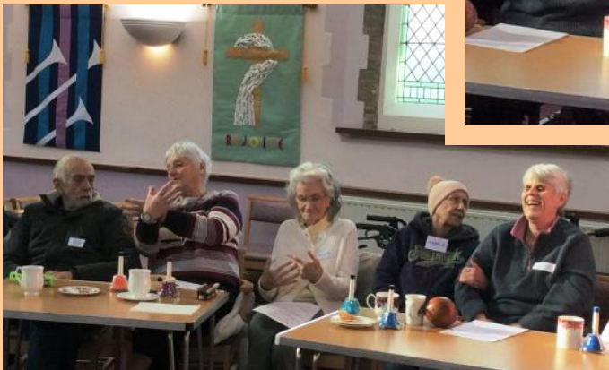
Singers enjoying the action songs