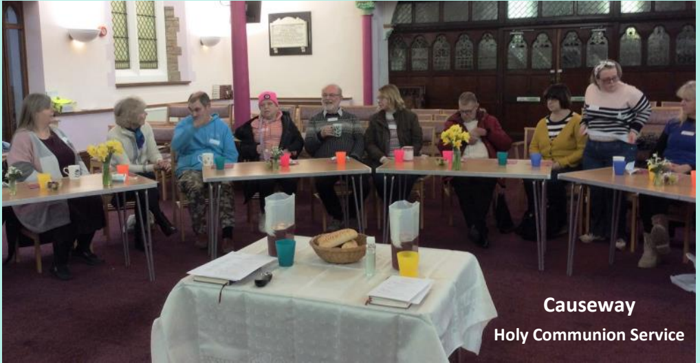
Causeway Holy Communion Service