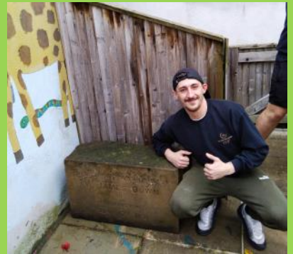
Many thanks to 'Top Tier Removals' for their help