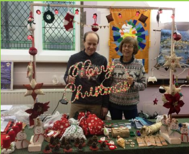
The Winter Fair was a huge success - Page 22