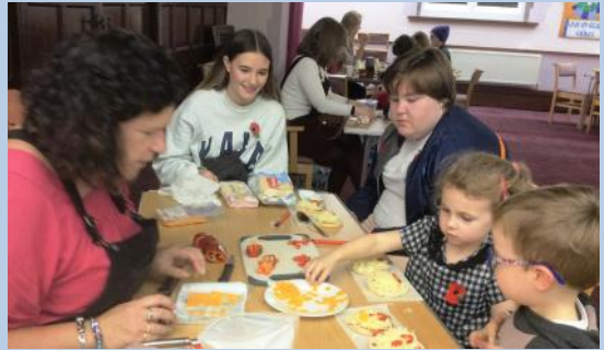
Café Church: Decorating muffin pizzas