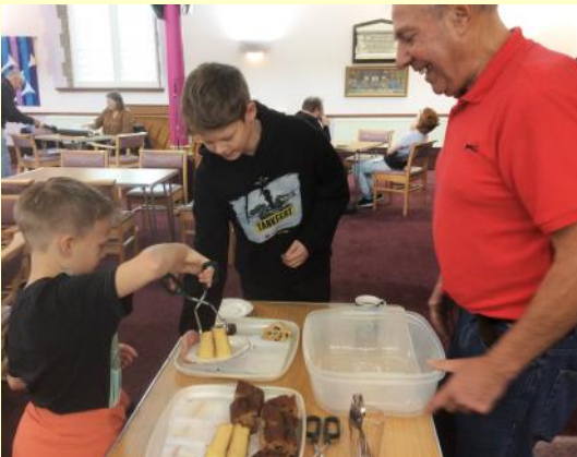
Grandchildren helping out at Hobnob