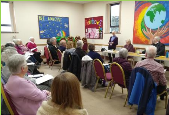
The Annual Church Meeting