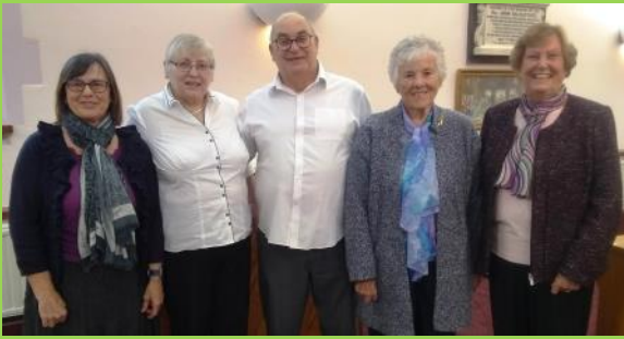
Christ the King: Members of the congregation led the Local Arrangement Service on November 20th - Page 10