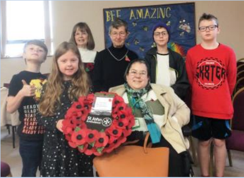
Sunday Club: Remembrance Sunday Service and watching the 2 minute silence at The Cenotaph