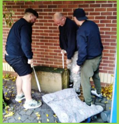
Moving the Foundation Stone