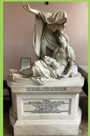
Discovering 'Faith' in Wetheral Church - Page 15