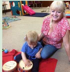
Parents & Toddlers