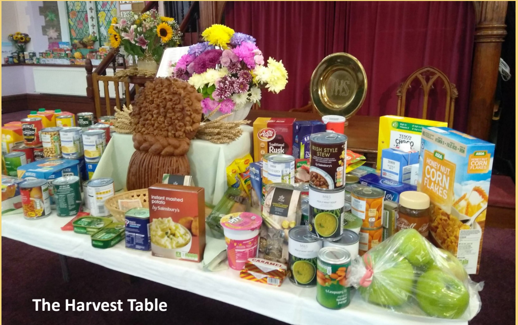
The Harvest Table