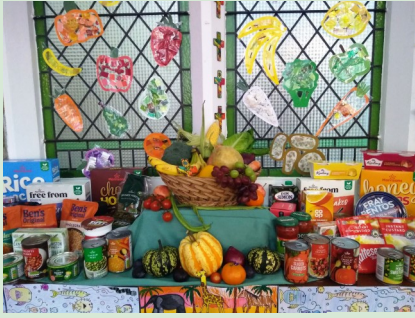
The Rainbows & Sunday Club window