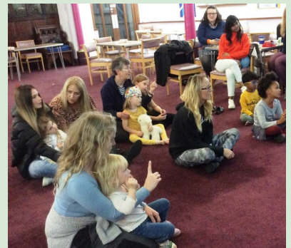
Singing the 10 lepers song