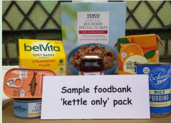
Sample foodbank 'kettle only' pack