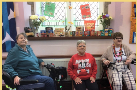
‘God’s Guys’ by the window they decorated