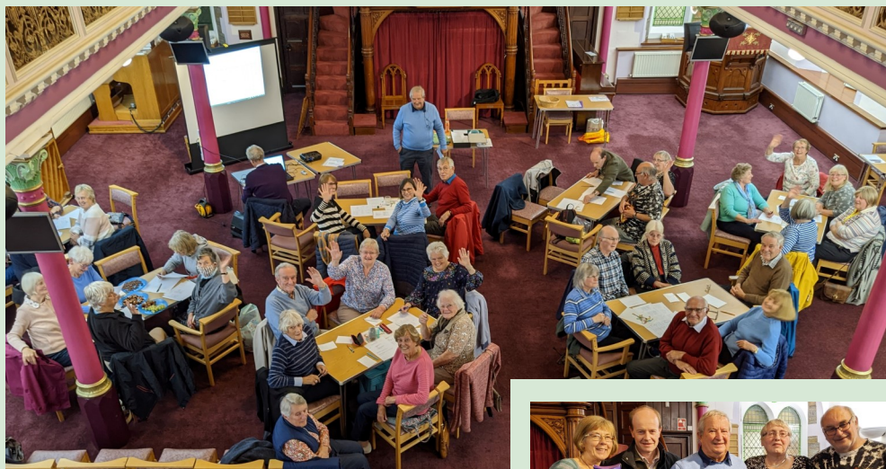
A fun evening had by all