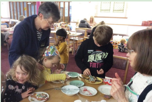
Decorating gingerbread men