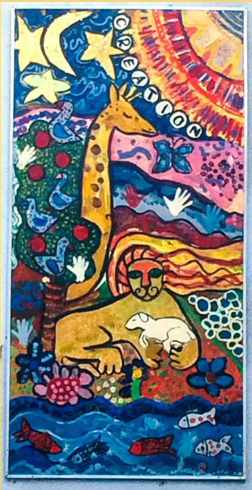
Our Marvellous Mural - Page 9