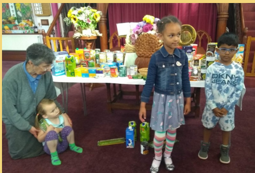
Sunday Club at the Harvest Service