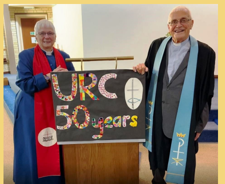
Celebrating 50 years of the URC at Christ Church, Braunton