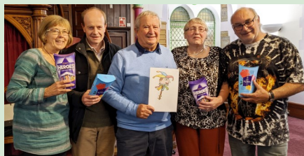
The 'Bonkers Conkers' won-just