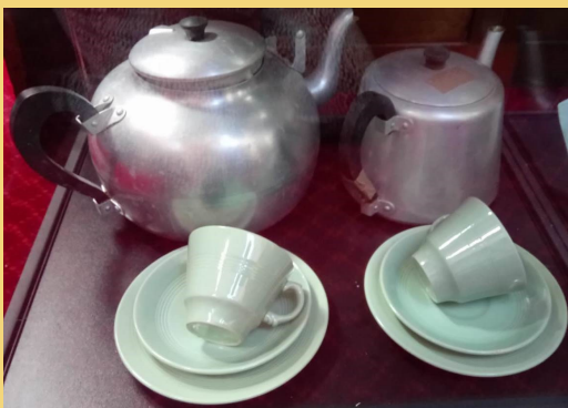
Museum piece: Green cups & saucers Page 18