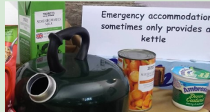
Emergency accommodation sometimes only provides a kettle