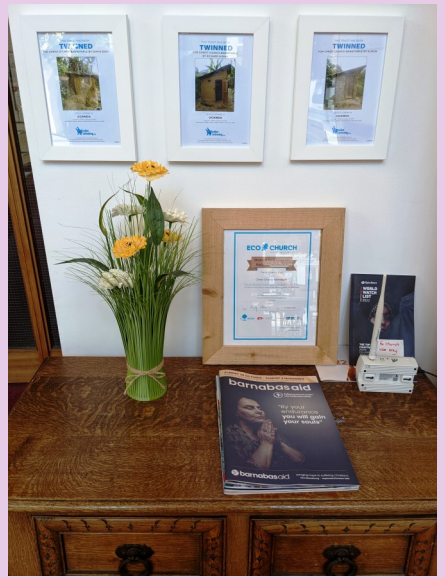
Toilet Twinning - page 11