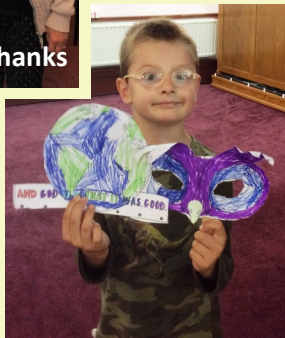
'Creation' mobile and animal masks