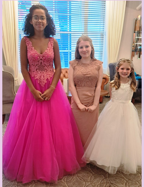
Carnival Queen's entourage Page 10