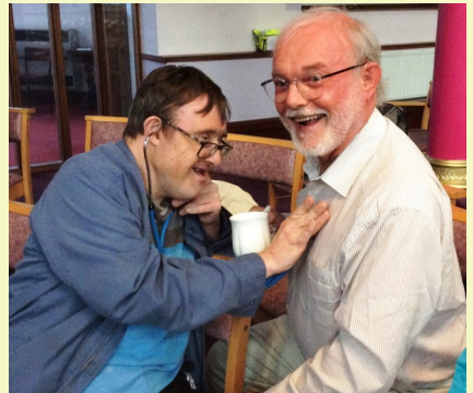
Testing out the stethoscope