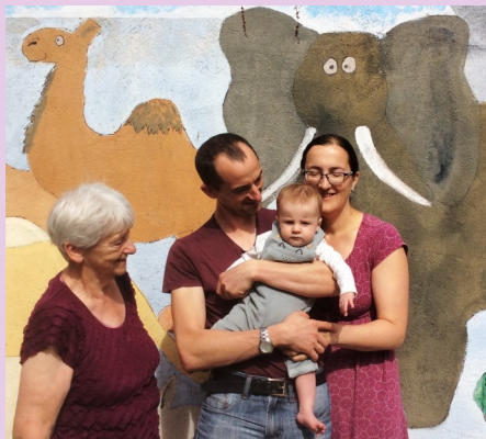
Eff's family on a visit to Christ Church