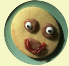
Smiling biscuits and learning actions to a new song. The theme was 'Action for Children'