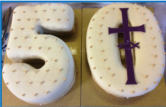
Happy Birthday United Reformed Church