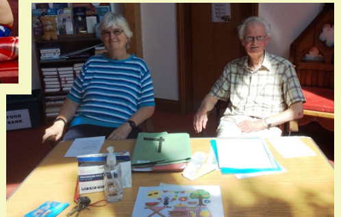
Despite the change of venue due to the heatwave, the picnic was a happy occasion of meeting up with friends. The children, as always, enjoyed the freedom and space of the church.