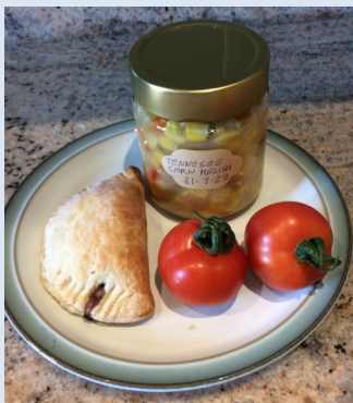
Recipe - Page 14