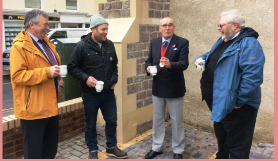
The Church Building is Unveiled!