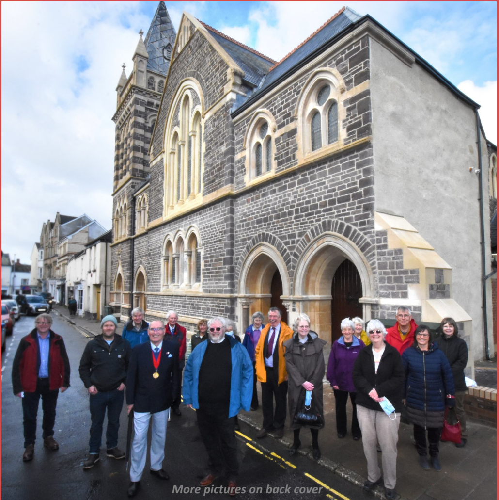
More pictures on back cover