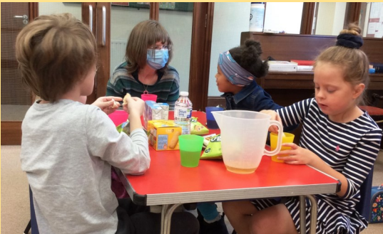
Snack & chat