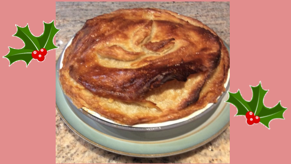
Boxing Day Pie Recipe—Page 15