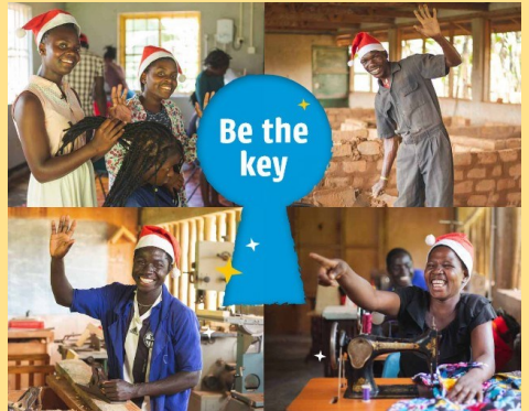
Be the Key—Amigos Christmas Appeal