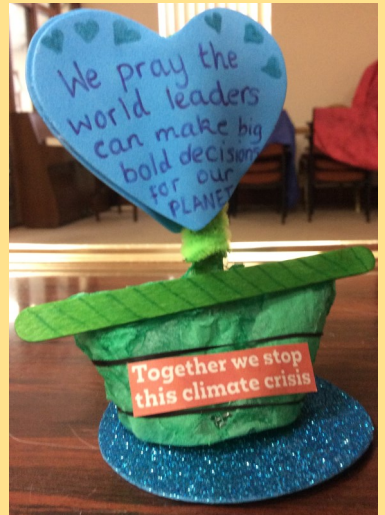
A special boat for COP26