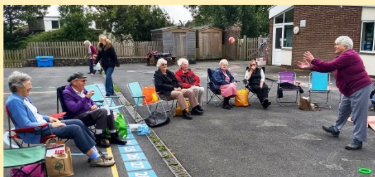
Church Picnic - Pages 8 & 9