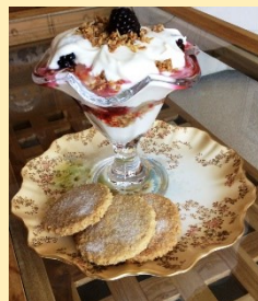
Recipe Page 17