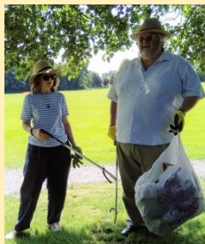
Park Clean Page 12

Welcome back! We are open again for Sunday morning worship