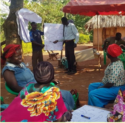
Training and planning for Trees for the Future