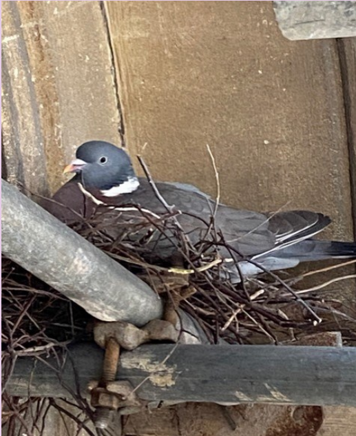
God's Feathered Friends