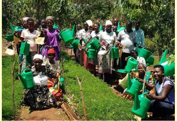
Putting theory into practice