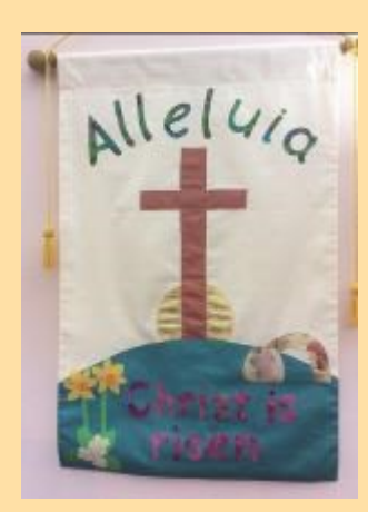
It was two years ago when we last celebrated Easter in the church building. Here are some of the beautiful decorations which adorned the sanctuary in April 2019