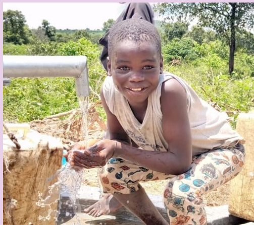
An Amigos borehole