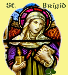
St. Brigid of Ireland—page 16