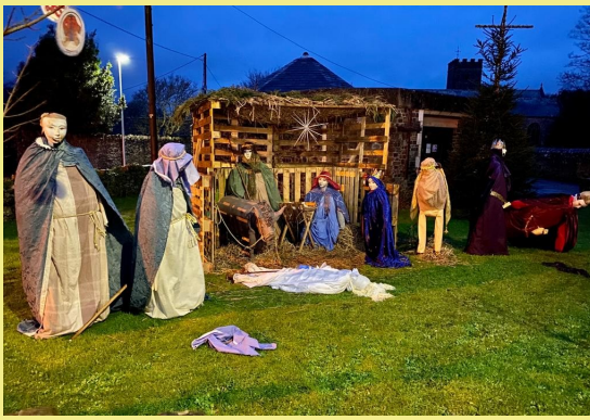
Nativity display at Fremington Parish Church. The strong winds blew over a wise man!