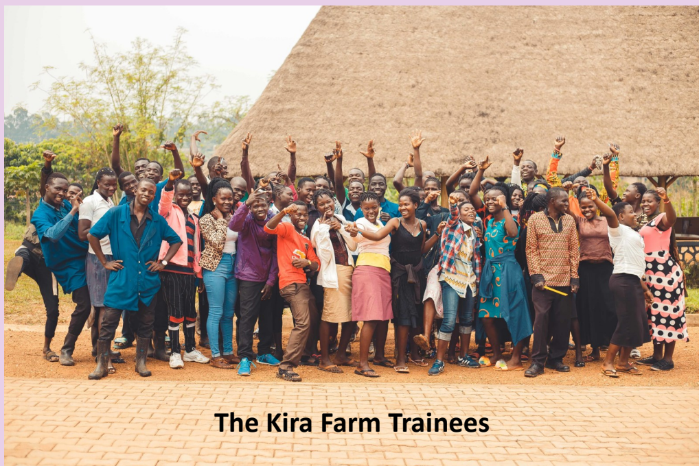
The Kira Farm Trainees