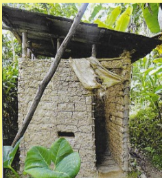
Toilet Twinning Update—page 15

Looking forward to a happier and brighter year