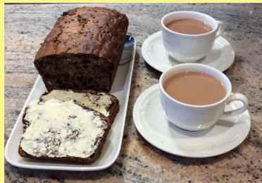
Irish Tea Bread Recipe—page 17