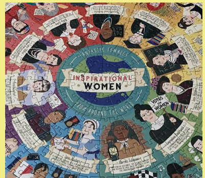
Eddy's 'Inspirational Women' jigsaw present