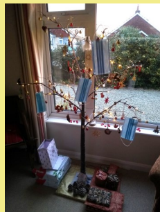
Winter tree with 'mask' decorations