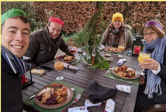
The Seymour's Christmas Dinner—outside!