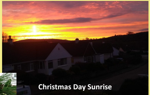
Christmas Day Sunrise