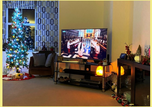
Watching 'Carols from Kings.'